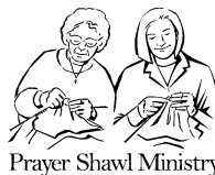
Prayer Shawl Ministry

THE CHURCH OFFICE WILL BE CLOSED on Monday January 19, Dr. Martin Luther King Jr. Day.